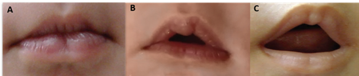
Fig. 1 Lip posture at rest. In A, closed, in B, half-open, and in C, open.

To verify the tongue position at rest, the maneuver described by Martinelli et al. 14 was performed. Facing each infant, the evaluator opened the mouth of the infant and raised the lateral margins of the tongue using the right and left gloved index fingers while the gloved thumb was positioned on the chin